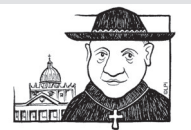
- Blessed Pope John XXIII (Pope from 1958 —1963)

To keep me from sin and straying from Him, God has used devotion to the Sacred Heart of Jesus in the Blessed Sacrament. My life was destined to be spent in the light radiating from the tabernacle, and it is to the Heart of Jesus present in the Blessed Sacrament that I dare go for the solution of all my problems."